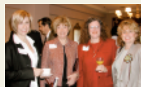
CLASSES OF '75, '85 AND '95 REUNITE