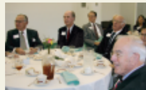
GRAND AVENUE GANG GATHERING