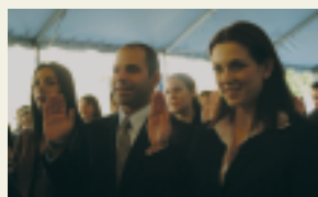
FALL 2004 SWEARING-IN CEREMONY