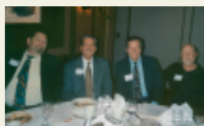
ENTERTAINMENT LAW LUNCHEONS COVER ETHICAL ISSUES AND GENDER BIAS