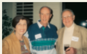
COACHELLA VALLEY ALUMNI GATHERING Alumni and friends gathered on November 20, 2004 for cocktails and dinner at the home