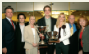
THIRD ANNUAL NATIONAL CIVIL TRIAL COMPETITION HELD AT LOYOLA LAW SCHOOL