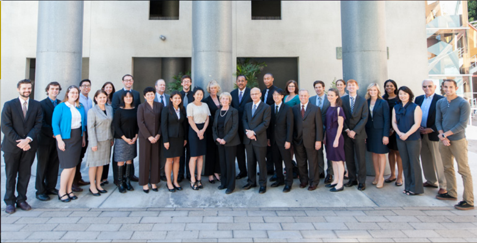
Donors and scholarship recipients celebrate together during the 2013 Scholarship Lunch.