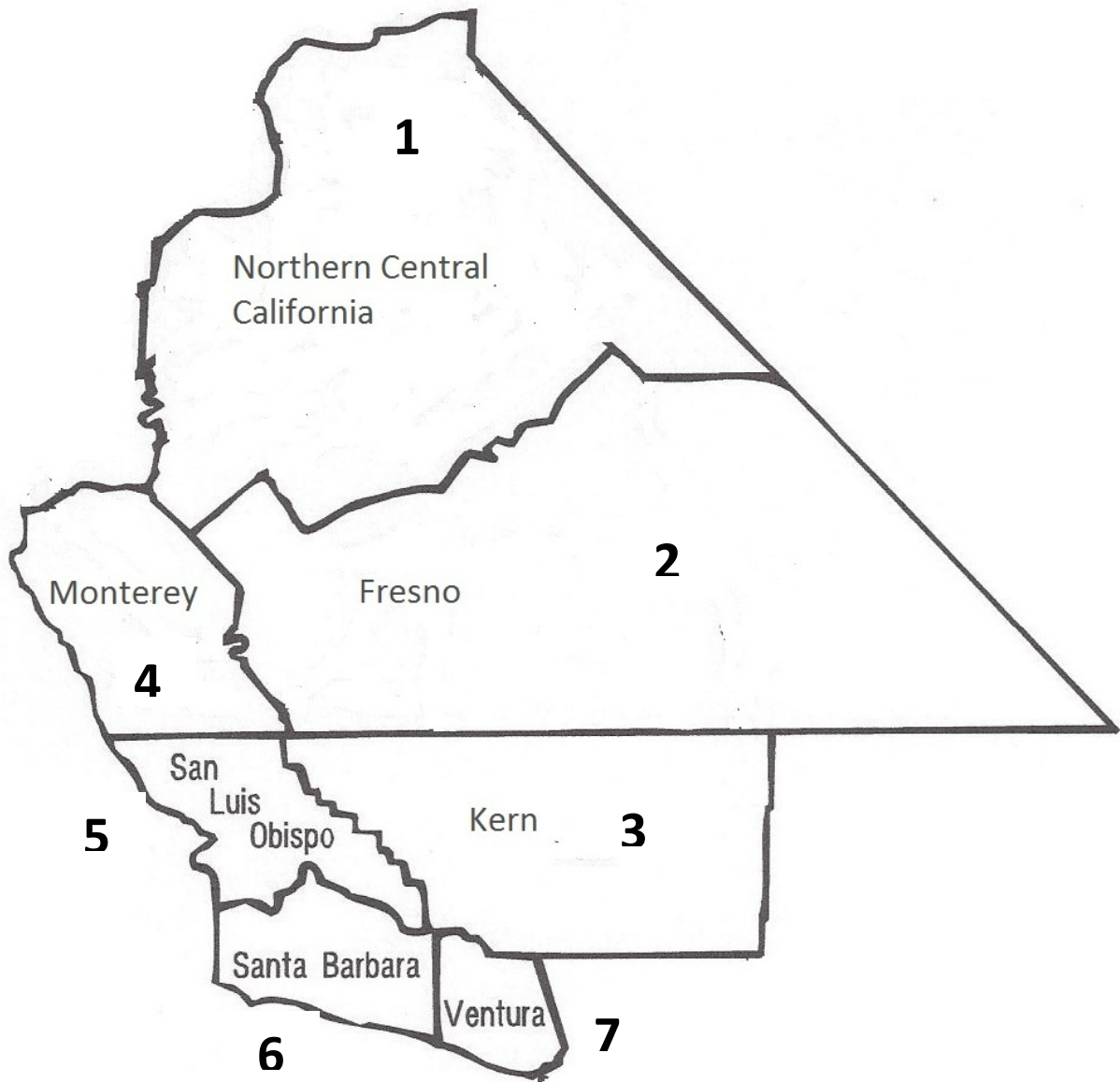
Map of Central California Regions*

*The regions in the VALOR guide are divided into eight areas commonly used by most public and private human service organizations in Central California