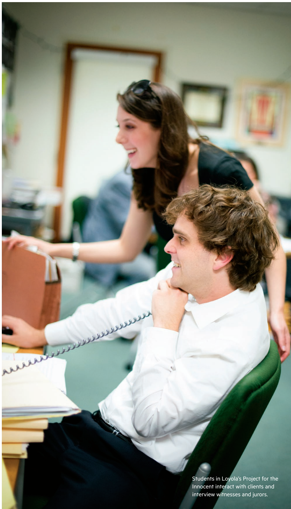
Students in Loyola's Project for the Innocent interact with clients and interview witnesses and jurors.