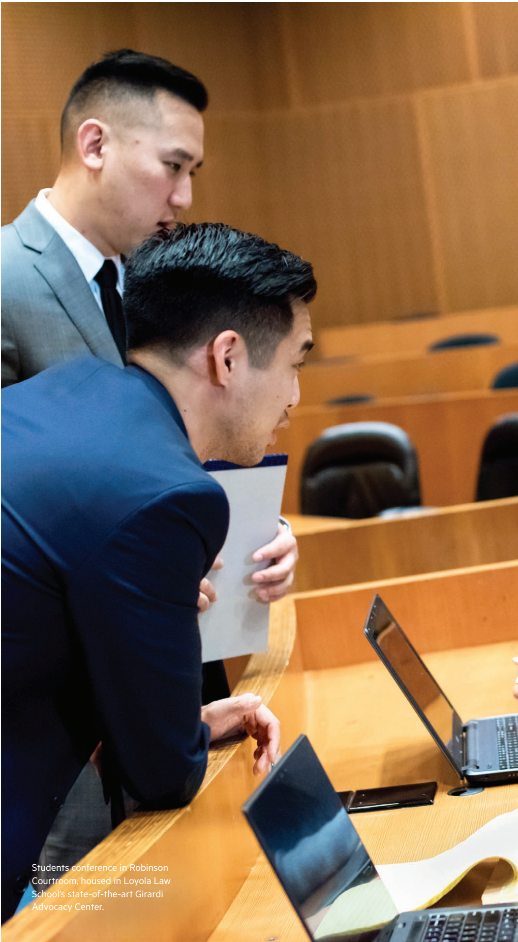
Students conference in Robinson Courtroom, housed in Loyola Law School's state-of-the-art Girardi Advocacy Center.