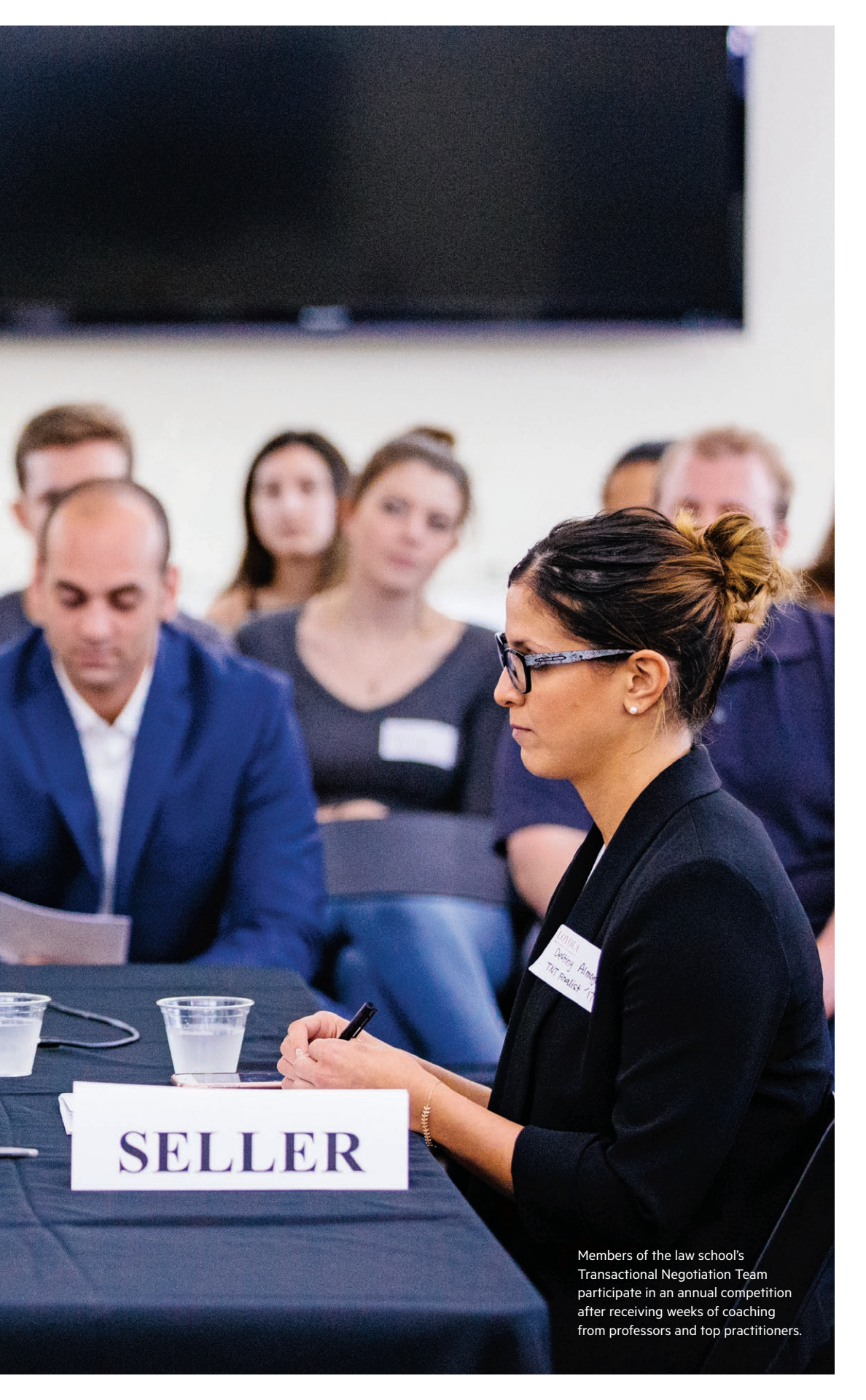
Members of the law school's Transactional Negotiation Team participate in an annual competition after receiving weeks of coaching from professors and top practitioners.